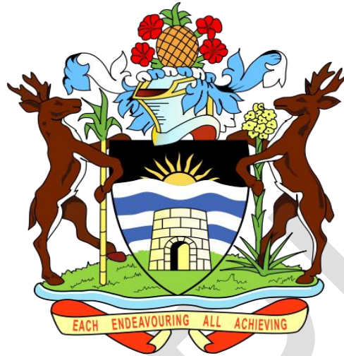
The Government of Antigua and Barbuda