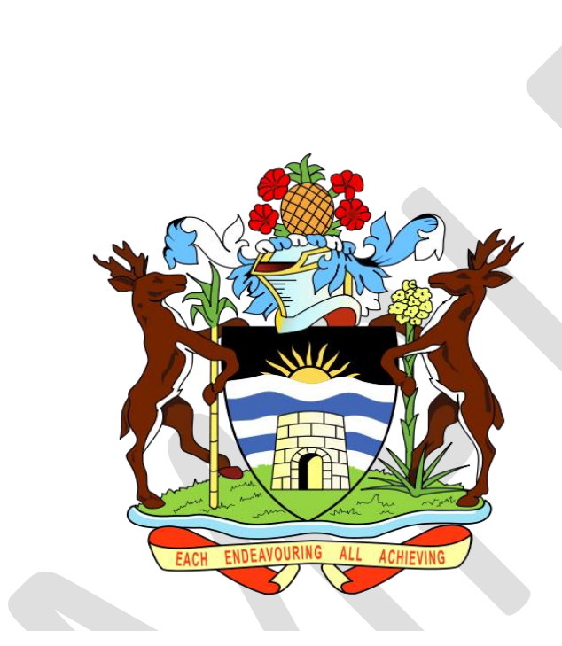
The Government of Antigua and Barbuda